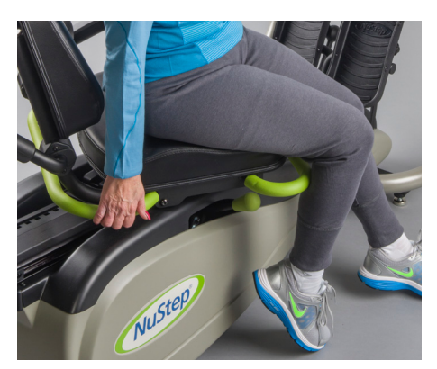
The 360° swivel seat locks at 45° intervals to offer greater accessibility for users of virtually all ability levels.