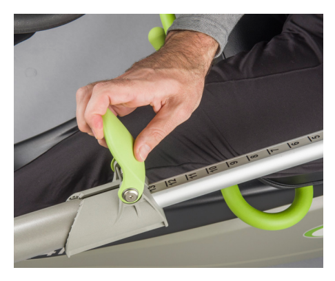
The NuStep arm handles are easy to adjust with user-friendly clamshell release levers.