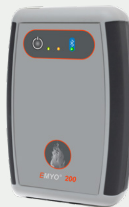
EMYO® 200 Dual Channel EMG