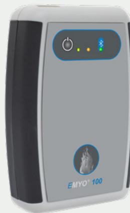
EMYO® 100 Single Channel EMG

Single & Dual Channel EMG Systems for Adult and Pediatric Pelvic Floor Rehabilitation